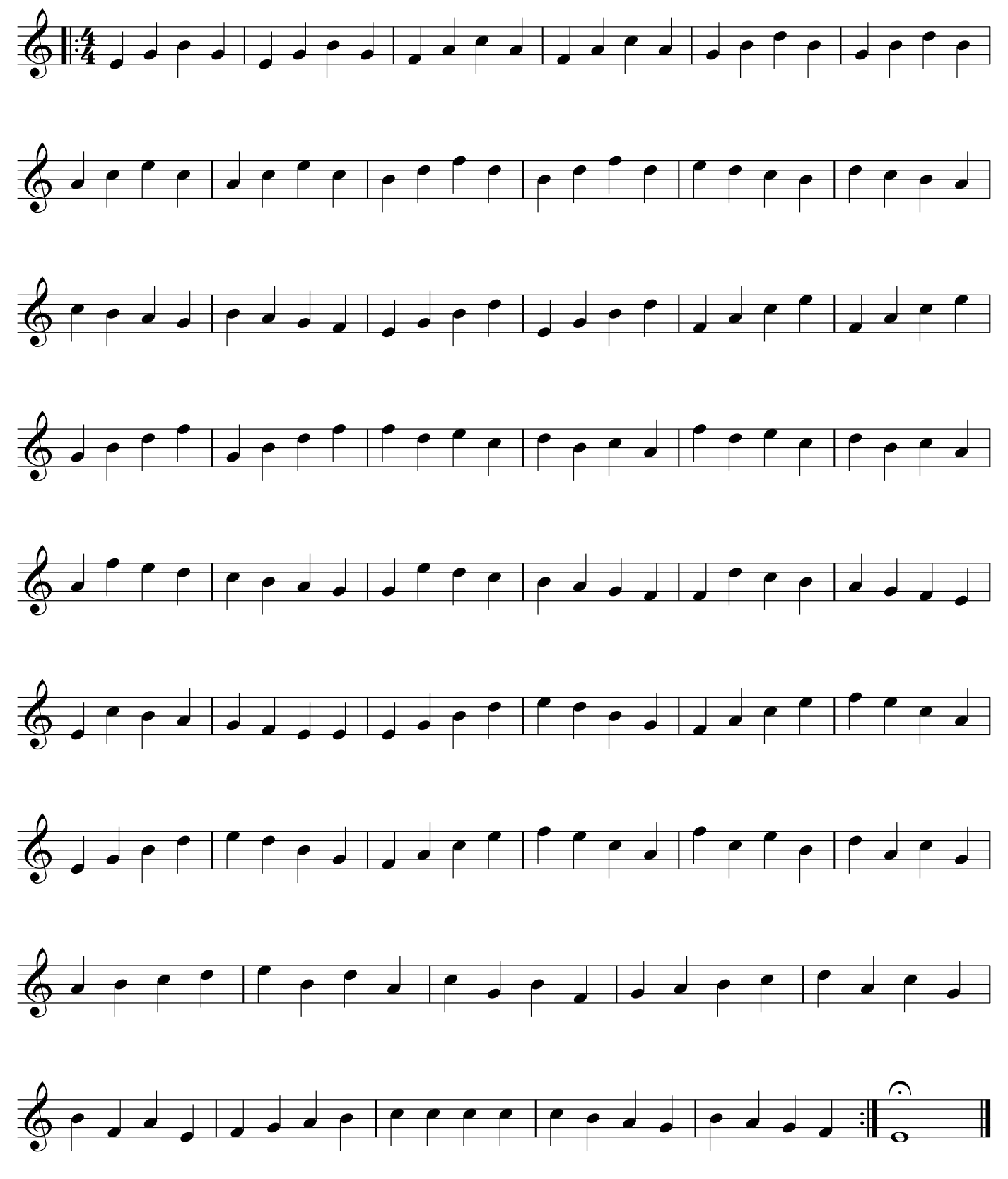
For more free worksheets and exercises visit: www.OneMinuteMusicLesson.com